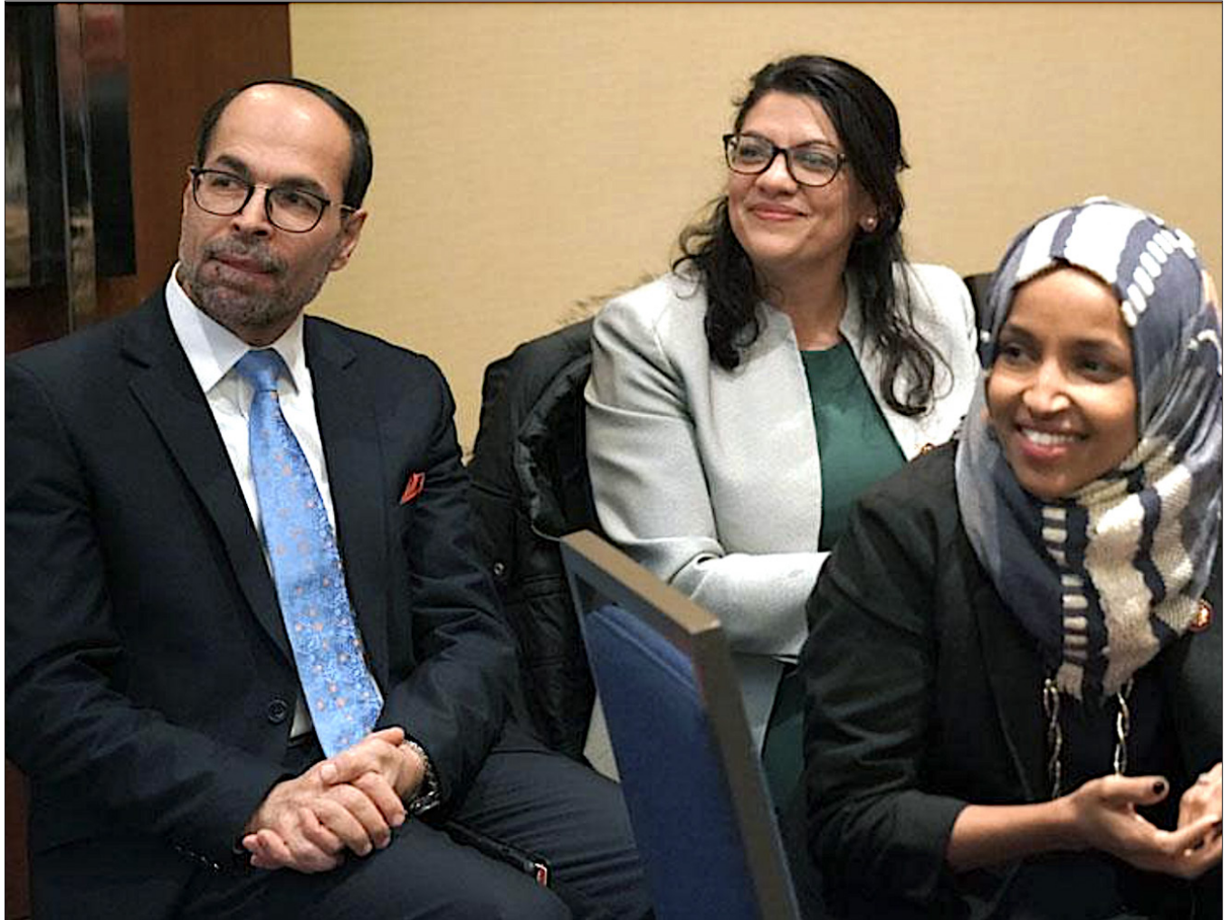
Nihad Awad with Rep. Rashida Tlaib (d-MI) and Rep Ilhan Omar (D-MN) at CAIR congressional reception.

CAIR presents itself as the foremost Muslim Civil Rights group in the US. Its input is sought by the White House and State Department. Earlier this year, it was listed as a trusted partner in the battle against anti-Semitism in President Biden's Strategy to Combat Anti-Semitism. But CAIR has also been a source of unadulterated anti-Semitism in the past, named #8 in SWC's Top Ten in 2021. Now, shocking comments made by its national executive director in wake of October 7th, brought condemnation from the White House. At an American Muslims for Palestine convention, Awad said he was "happy to see" the people of Gaza "breaking the siege" on October 7th when Hamas attacked Israel and murdered 1,200 Israelis in cold blood. Awad also described Gaza as an "outdoor concentration camp."