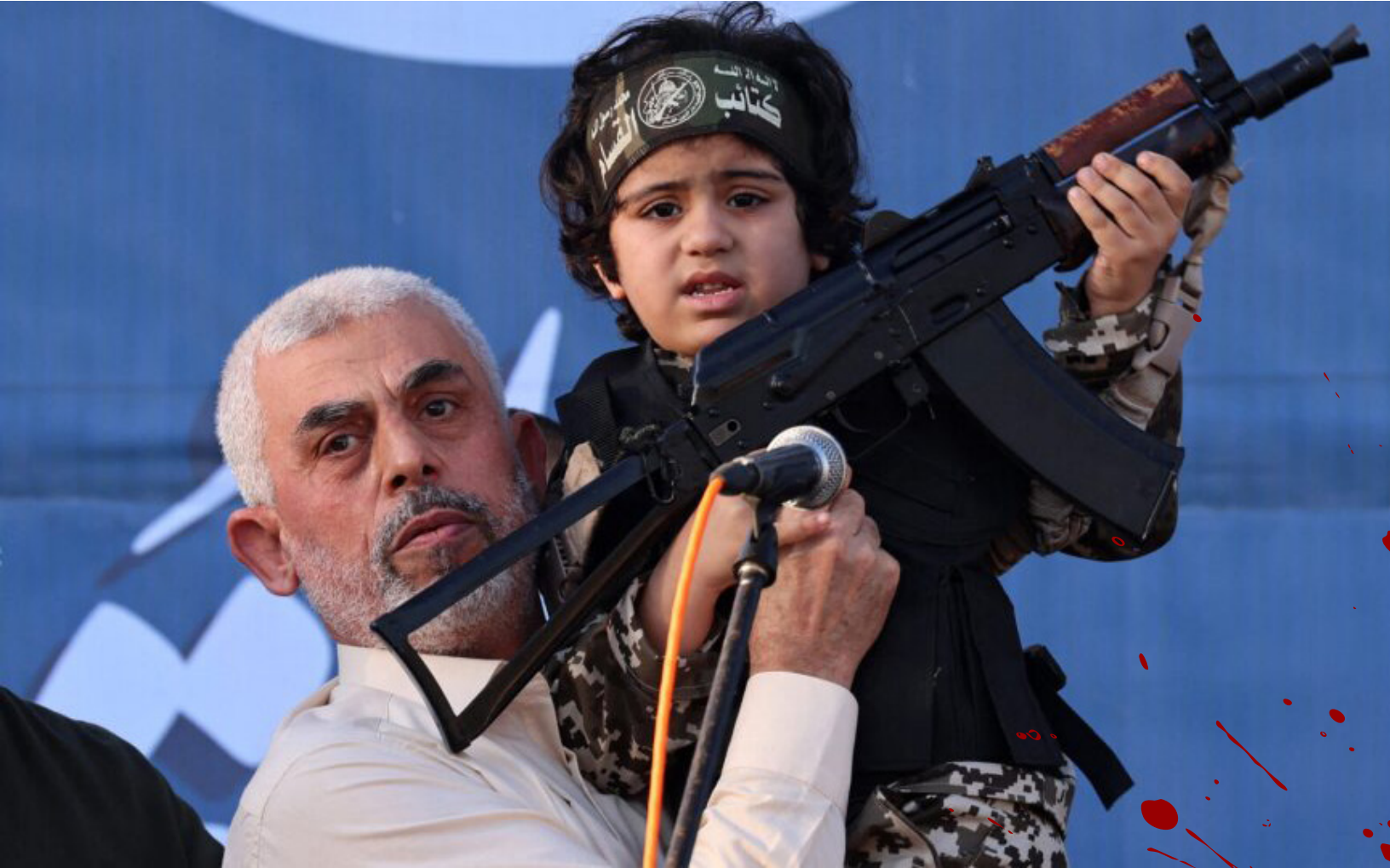
Hamas leader Yahya Sinwar