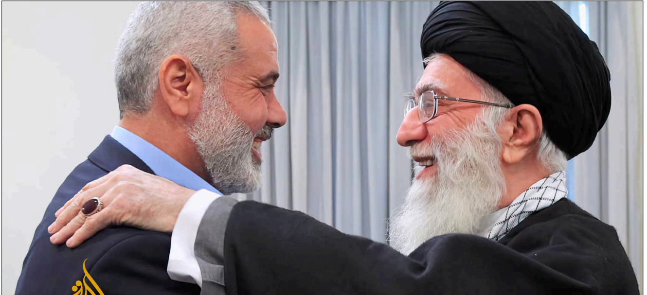
Hamas leader Ismail Haniyeh meets with Iran's Supreme Leader Ayatollah Ali Khamenei in Tehran, June 22, 2023.