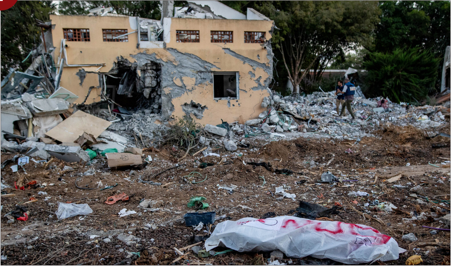
A dead body after the devastating assault by Hamas terrorists in Kibbutz Be'eri, near the Israeli-Gaza border, in southern Israel, October 11, 2023