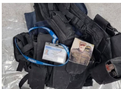
The Israeli military discovered the vest of a Hamas terrorist alongside his UNRWA identification badge.