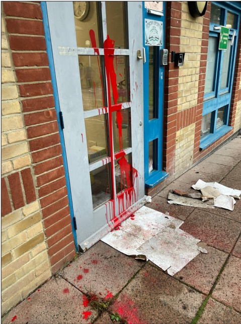
Red paint thrown at a Jewish school in London, UK